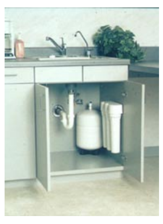
Microline® R.O. Systems install easily under your sink or cabinet.